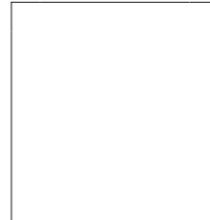
Right index fingerprint of alien removed

_____ (Signature of alien being fingerprinted)