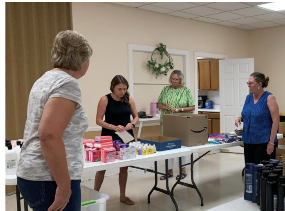
UWF at St. Johns, Buena Vista prepare UMCOR kits

Save the Date: October 17 from 2:00—3:30 PM